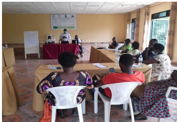
The Project Manager of ANSP+/KC /Fu G addressing participants at Nyagatare on 29/12/2021