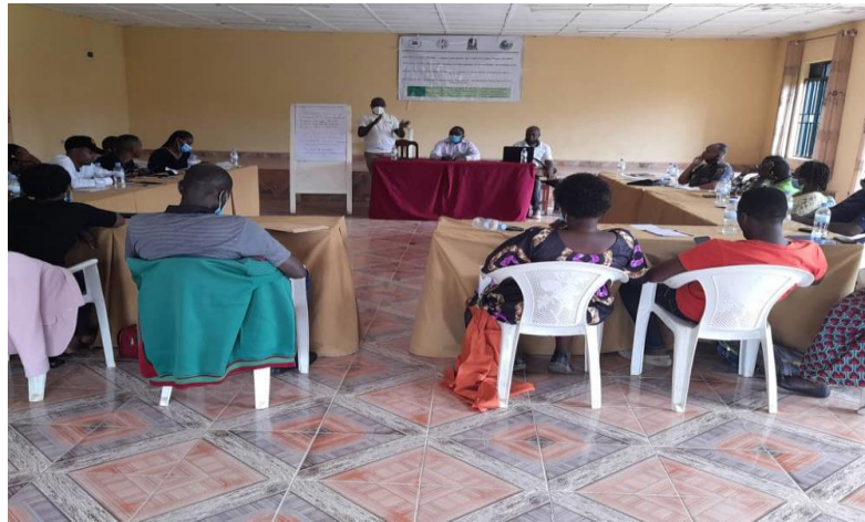
The district official (DJAF) talking to the participants of the training

After the speech by the district official, the next step was about what should be done by each group of people there present to promote the rights of Key populations. Different questions were given to participants and they gave their recommendations as follow: