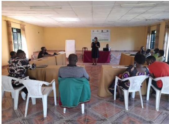
The training facilitator talking to the participants at Moons Charity Hotel Nyagatare on 29 Dec 2021

The training facilitator further explained that HIV is spread mostly through unprotected sex and that people likely to spread it include Key populations including sex workers, LGBTs and drug users. Some of the methods of preventing against HIV mentioned include the proper use of condoms, self-testing kits and PrEp .